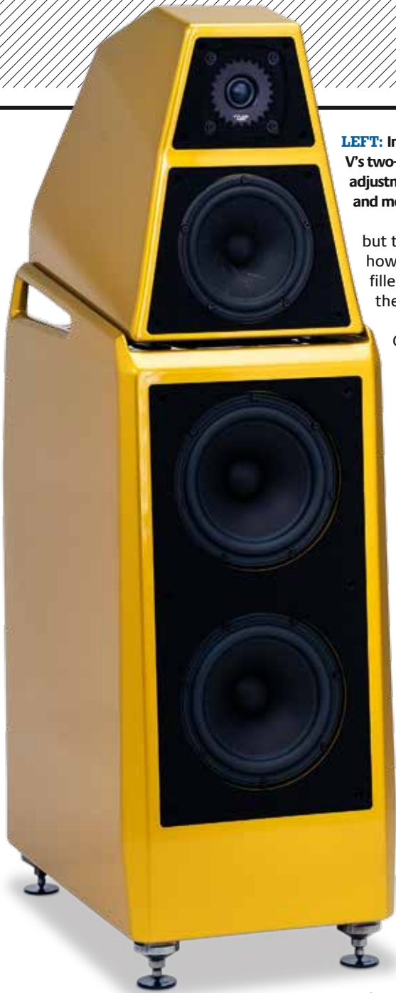
LEFT: Improved over the Sasha DAW, the Sasha V's two-position front spike track enables finer adjustments for the mid/treble head assembly and more adaptable 'real world' time alignment

but they were insufficient in conveying how comprehensively the Sasha Vs both filled the room and gave the impression of the walls disappearing.