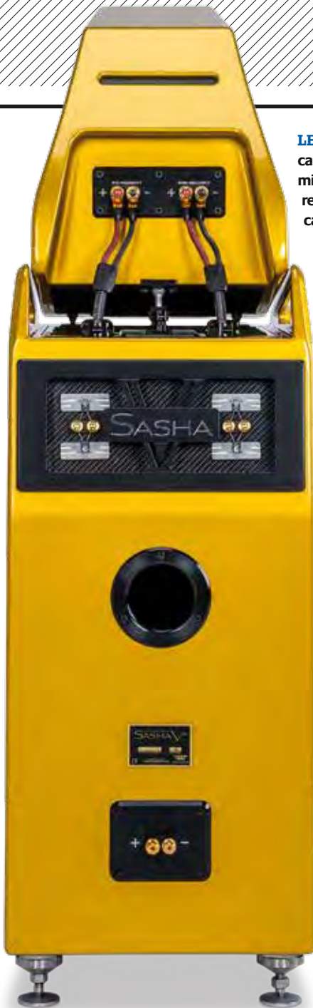
LEFT: Rear view shows lower-to-upper cabinet connections, rear-firing port, midrange vent and access to 'protection' resistors. As the crossover is in the main cabinet, it does not support bi-wiring

'Tempted'. The Sasha Vs allowed Thomas's voice to soar, again begging the use of 'majestic' as the only suitable description.